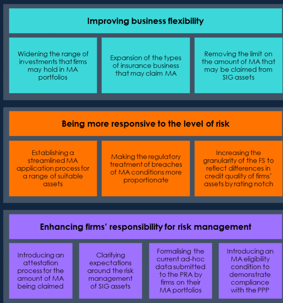
Chart 1: Impact of the proposals in this CP

1.7 In addition, the PRA has taken the opportunity to make clarifications to existing policy by implementing minor changes to PRA guidance to bring this up to date with firms’ current practices.