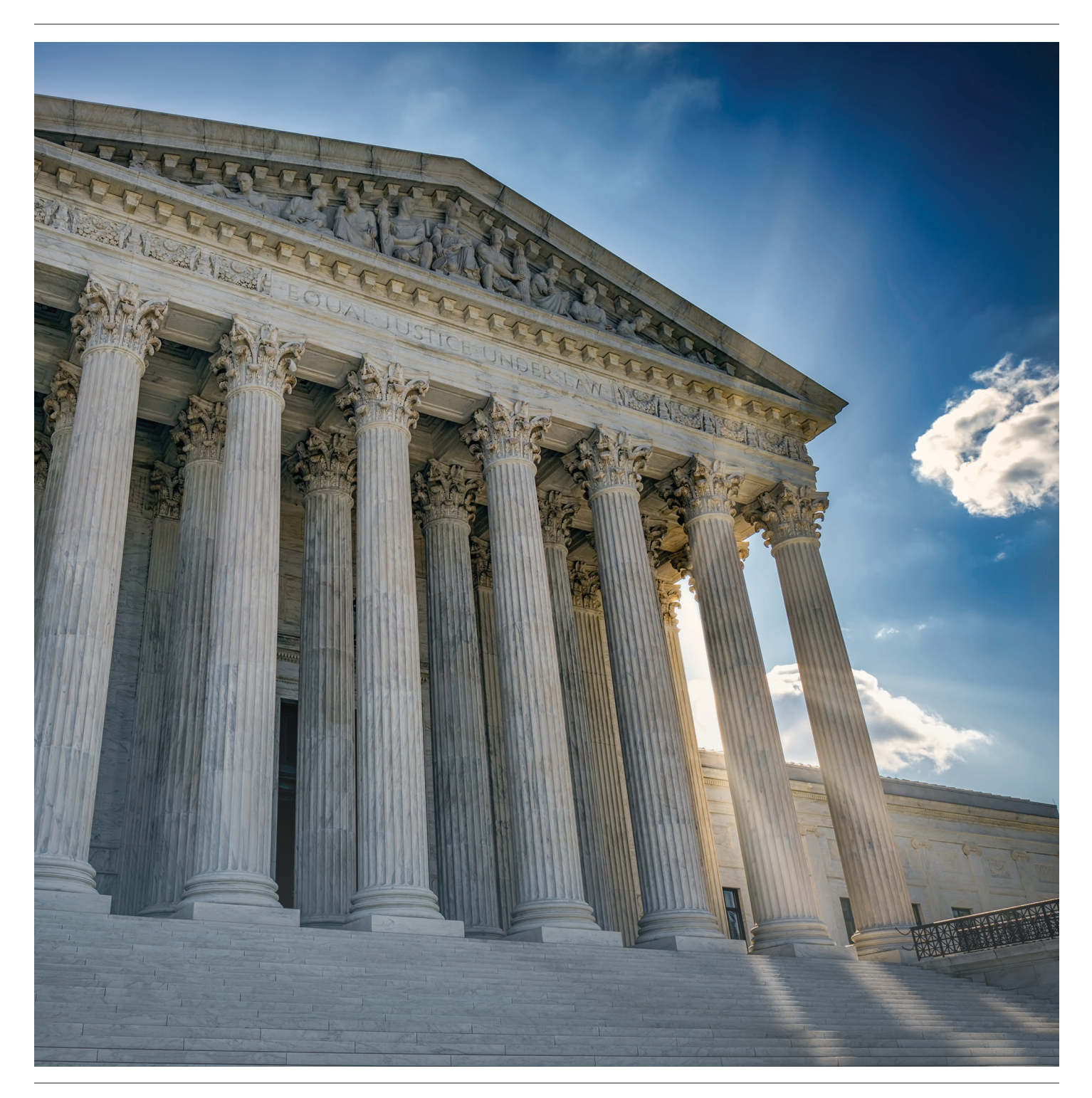
Skadden, Arps, Slate, Meagher & Flom LLP and Affiliates

Beijing Hong Kong Seoul Shanghai Singapore Tokyo