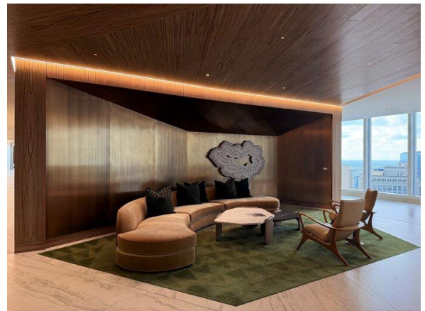
Skadden's newly designed space in downtown Houston is outfitted with the latest technology and offers expansive views of the city.