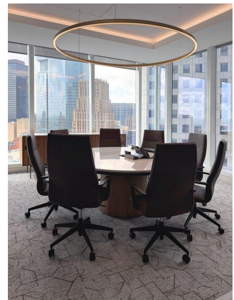
Skadden's newly designed space in downtown Houston is outfitted with the latest technology and offers expansive views of the city.