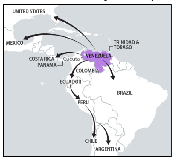
Figure 4. Venezuelan Migrants and Asylum Seekers: Flows to the Region and Beyond