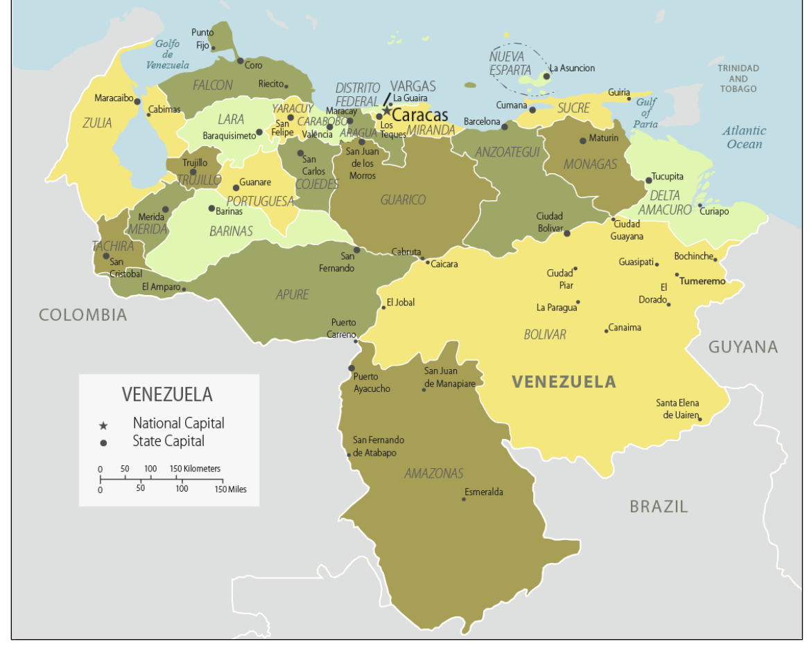
Figure 1. Map of Venezuela

the opposition (except the VP party) entered talks with the government mediated by the Vatican and others. By December, the talks failed as the Maduro government failed to meet its commitments.